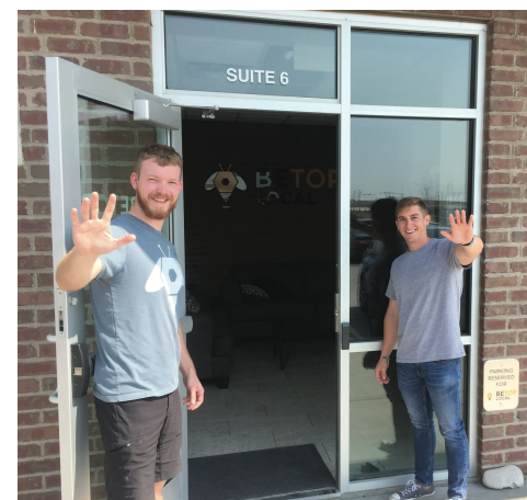
Front Door Welcome Photo