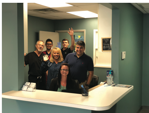
Front desk photo

We need 3-4 appointments per day 4-5 days a week