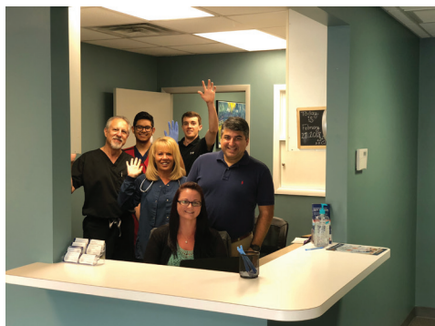
Front desk photo