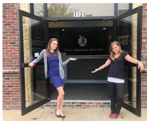
Front Door Welcome Photo